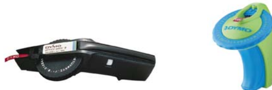
Blast from the past: Classic vintage DYMOs from yesteryear

DYMO's come a long way since the early handheld label maker days you may remember from years past. They've been in business over 40 years, and are now the worldwide leader in providing innovative labeling solutions. By the way, DYMO recently was acquired by Newell Rubbermaid and will be part of the "Sanford Brands" Business unit.