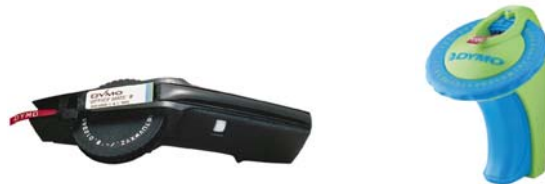
Blast from the past: Classic vintage DYMOs from yesteryear

DYMO's come a long way since the early handheld label maker days you may remember from years past. They've been in business over 40 years, and are now the worldwide leader in providing innovative labeling solutions. By the way, DYMO recently was acquired by Newell Rubbermaid and will be part of the "Sanford Brands" Business unit.