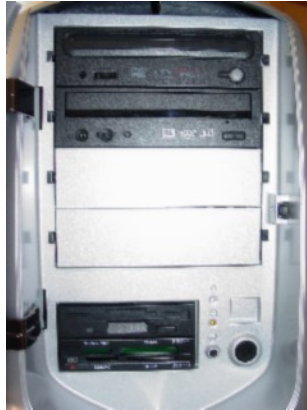
The door is now ajar