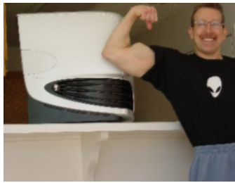
Muscle Machine vs. Muscleman