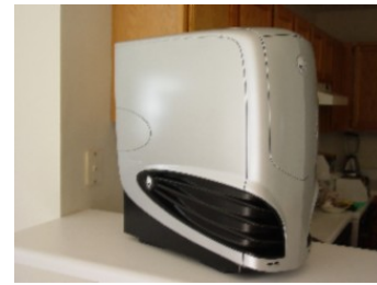
Saucer Silver Predator