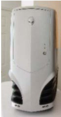
Frontal view of the Predator case

name & account imprinted in silver), and applicable OS CD's including drivers and recovery disks. Finally, there is brief documentation for getting started and warranty data. Yeah, that's just the binder. Rounding out the accessory box is your custom painted Microsoft Internet Keyboard and IntelliMouse Explorer 3 (to match the case color you choose), the Alienware Cable Management Cage to keep those cables tidy, extra adapters, parts and other CD's from your chosen components. The two remaining items are my favorites. The infamous Alienware branded black T-Shirt (the only mod I'm doing is to the "T"...converting to a Muscle-T!), and the deluxe Alienware Mousepad called "sUrface 1030"—very classy!