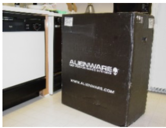
A box as tall as a dishwasher